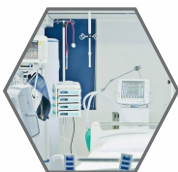
Critical Care Equipments